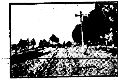
A COUNTRY ROAD POORLY RECONSTRUCTED.