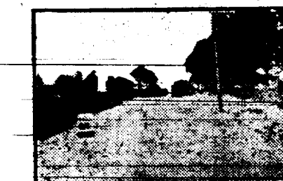
WHAT COULD BE DONE FOR THE FARMER?

The modern farmer studies the markets and crop conditions as closely as does the operator of a business.